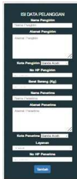
Fig. 5. Page of Delivery Services Input

In this system, customer services fill out the form of customer request for delivery services. Page of delivery service input is shown in Figure 5. Upon completion, those data will be stored on the database. All of transaction which is shown in Figure 6 can be accessed by customer services. After the customer service fill out the transactions of goods delivery, the customer will receive a tracking code that will be used to check the status of the goods delivered. The information of goods tracking can be accessed by inputting the tracking code on tracking page which is shown in Figure 7. If the tracking code that is entered is valid, the system will show the delivery services description such as origin shipment, destination shipment, the weight of goods shipped, delivery mileage, travel route and delivery status of goods that is shown in Figure 8.