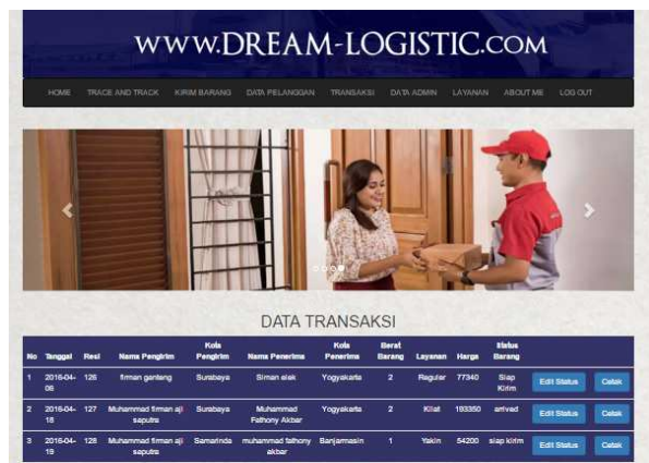
Fig. 6. Transaction Page